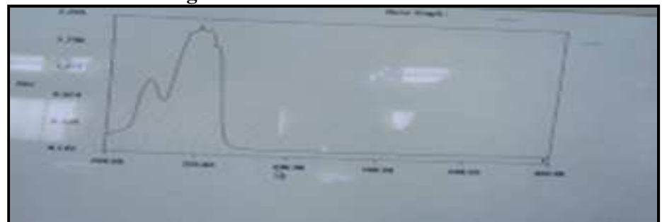
Figure No.2: UV spectrum of Imatinib

Available online: www.uptodateresearchpublication.com January – March